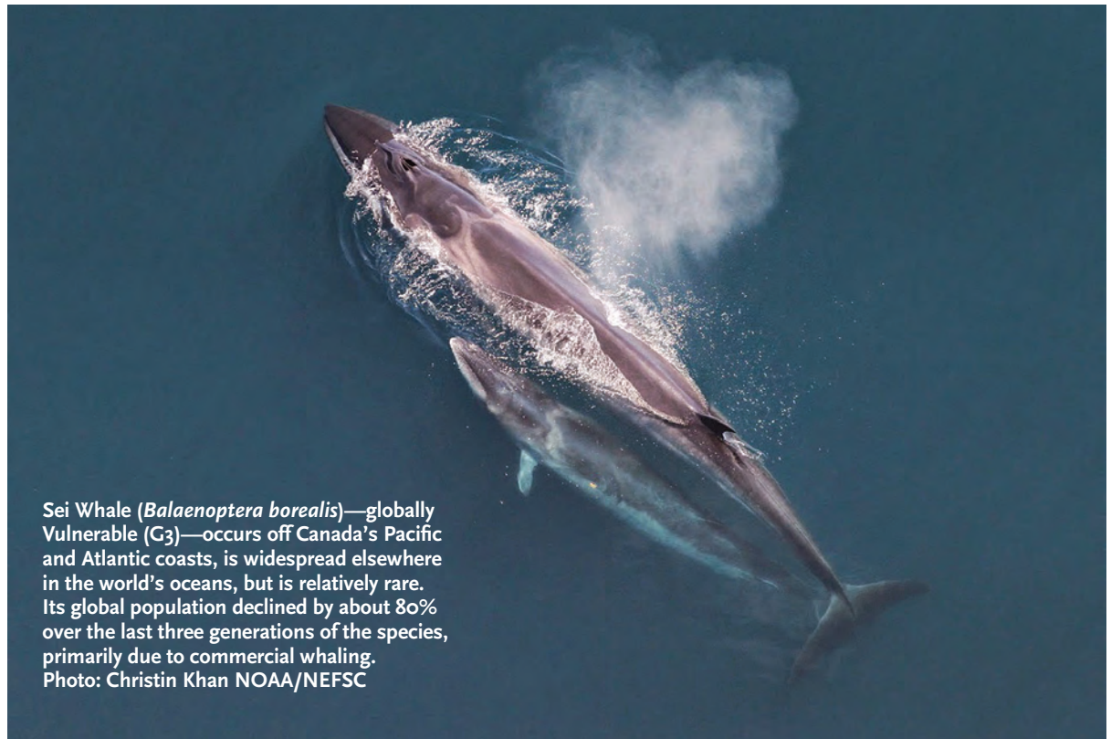
Sei Whale ( Balaenoptera borealis)—globally Vulnerable (G3)—occurs off Canada's Pacific and Atlantic coasts, is widespread elsewhere in the world's oceans, but is relatively rare. Its global population declined by about 80% over the last three generations of the species, primarily due to commercial whaling.