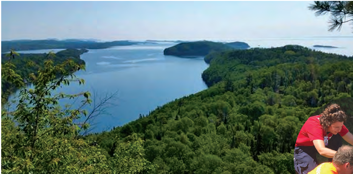
Big Trout Bay, near Thunder Bay.