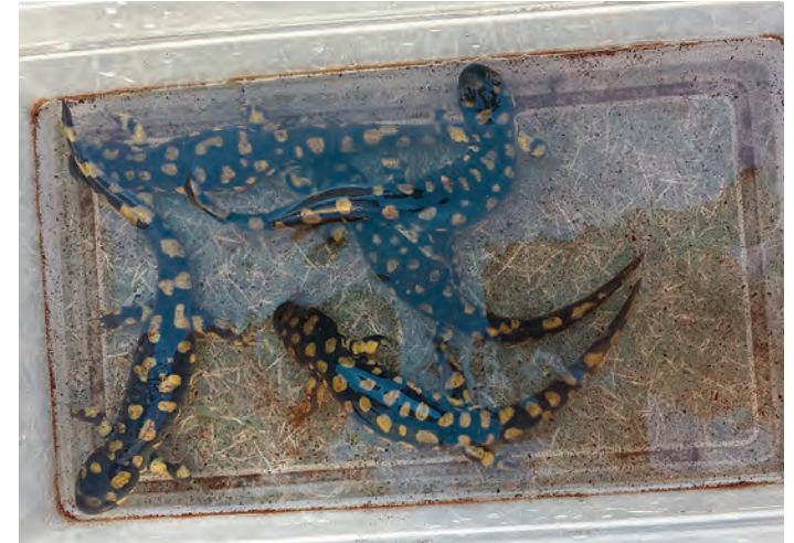
Eastern Tiger Salamanders ( Ambystoma tigrinum ) under study by the Manitoba Conservation Data Centre (MBCDC).

Measuring Eastern Tiger Salamander larva.