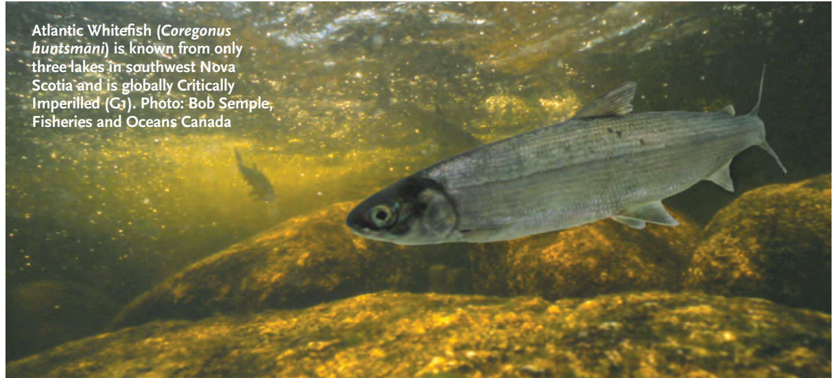
Atlantic Whitefish ( Coregonus huntsmani) is known from only three lakes in southwest Nova Scotia and is globally Critically Imperilled (G1).

In this context, NatureServe Canada is pleased to welcome Fisheries and Oceans Canada (DFO) as its newest organizational member. Alongside Environment and Climate Change Canada and the Parks Canada Agency, DFO becomes the third federal department or agency with Associate membership status. The department's principal responsibilities include contributing "to a clean and healthy environment and sustainable aquatic ecosystems through habitat protection, oceans management, and ecosystems research." Pursuant to the federal Species at Risk Act, DFO is involved in assessing the conservation status of aquatic and marine species, and in formulating recovery plans for at-risk species. The department's engagement with NatureServe Canada and the NatureServe Canada Network will support enhanced data and information sharing concerning aquatic and marine species and their associated ecosystems.