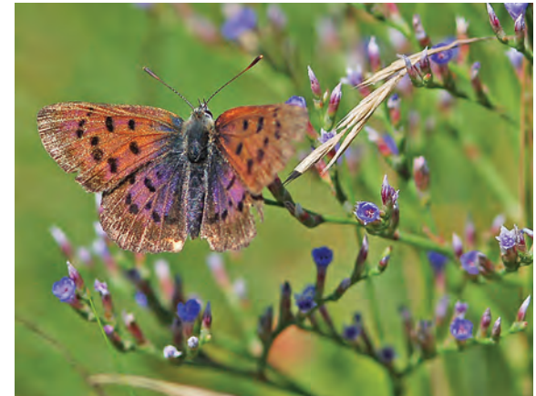
Left: Spotted Owl ( Strix occidentalis)—globally Vulnerable (G3). Centre: Cain's Screw Moss ( Syntrichia cainii)—globally Critically Imperilled (G1). Right: Maritime Copper ( Lycaena dospassosi)—globally Vulnerable (G3).