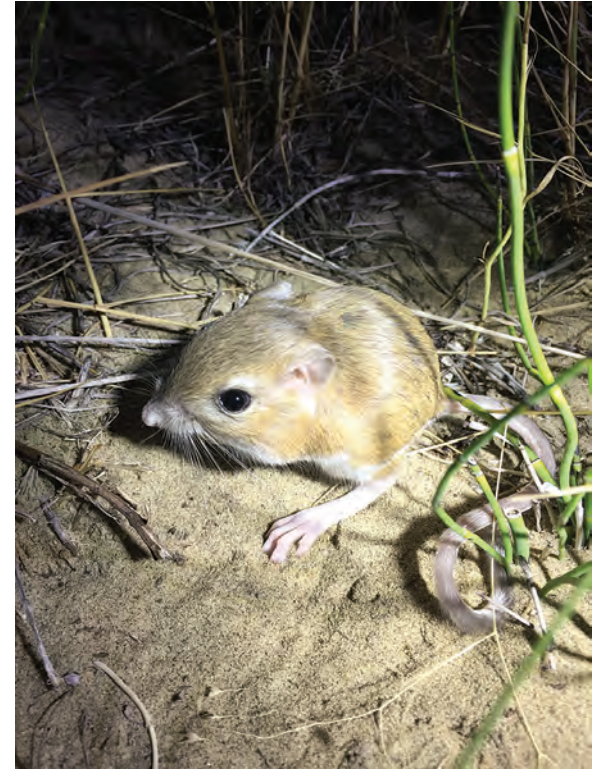
Ord's Kangaroo Rat ( Dipodomys ordii ) is a nationally Imperilled (N2) species also listed as Endangered under Canada's Species at Risk Act.

Data on the status of the Saskatchewan population of this species was recently identified by the Committee on the Status of Endangered Wildlife in Canada as an important knowledge gap. To help address that, the Saskatchewan Conservation Data Centre (SKCDC) and the Saskatchewan Ministry of the Environment recently teamed to survey potential habitat and gain greater knowledge of this species' provincial distribution. Surveys were conducted not only in the Great Sandhills but also additional sandhills located in southwestern Saskatchewan (e.g., Burstall, Seward, Westerham sandhills). Daytime habitat surveys helped to detect signs (e.g., burrows and tracks) of the presence of Ord's Kangaroo Rat and nighttime surveys were used to detect actual presence. Through this work SKCDC staff were able to confirm the presence of the species throughout all of the active dune complexes surveyed, except for those in the Piapot and Antelope sandhills.