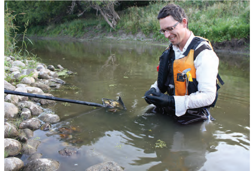
Surveying for freshwater mussels along the Antler River, Manitoba.