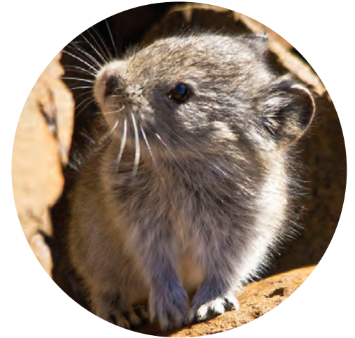
Collared Pika ( Ochotona collaris)—this cold-adapted alpine mammal is ranked as Vulnerable (S3) in B.C., Yukon, and Northwest Territories with concern for how climate change may diminish its persistence over time.