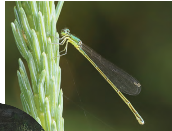
Top: Sedge Sprite ( Nehalennia irene )—globally Secure (G5).