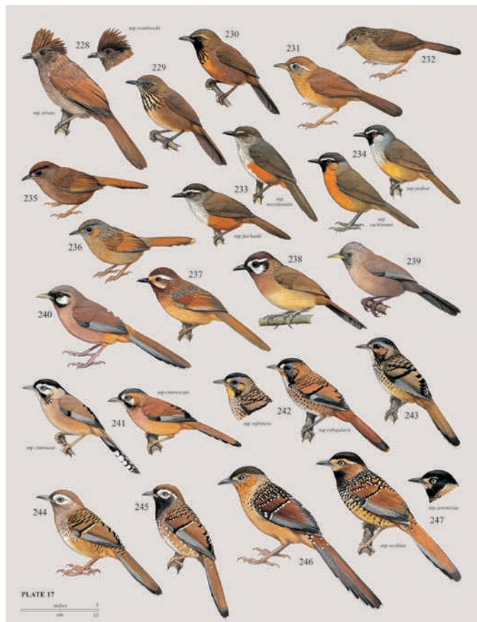
Figure 1 | Diversity delimited. The laughingthrushes, illustrated by H. Burn in the Handbook of the Birds of the World 11 , encompass a great diversity of closely related forms living in different parts of Asia. Tobias and colleagues’ framework 2 promises to shed light on species limits in such situations.