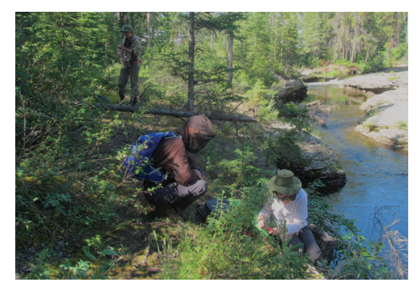
Surveying for moss species in Northwest Territories in 2018.

STABLISHED IN 2013, the Northwest Territories Conservation Data Centre (NTCDC) works in a co-management setting, meaning that all organizations with legislated responsibilities for biodiversity in the NWT are part of the NTCDC. These include territorial and federal departments and wildlife co-management boards set up under land claim settlement agreements, such as the Wildlife Management Advisory Council (WMAC-NWT) and the Gwich'in, Sahtu, and Wek'eezhii renewable resources boards.