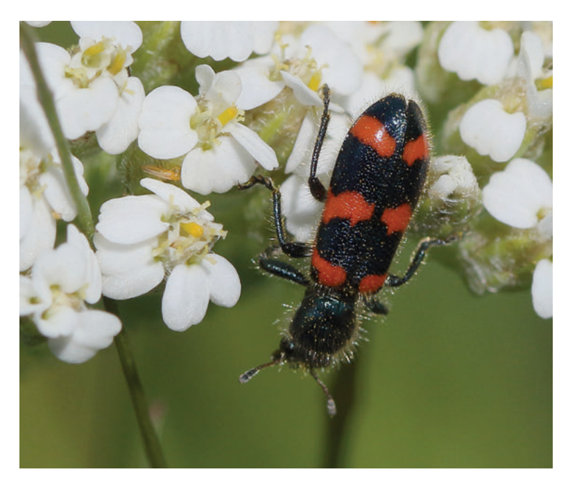
Red-blue Checkered Beetle ( Trichodes nuttalli ) pollinating Common Yarrow ( Achillea millefolium ) at Queen Elizabeth II Wildlands Provincial Park in Ontario.

OLLINATORS ARE ANIMALS, including various bees, wasps, flies, ants, butterflies, and beetles (and in some parts of the world lizards, birds, bats, and other mammals) that move pollen from the male anther of a flower to the female stigma of a flower, thereby aiding the ability of flowers to produce seeds and fruit. As such, pollinators are vital to helping maintain both wild and cultivated plants, and thus by extension to maintaining ecosystem health and agricultural productivity.