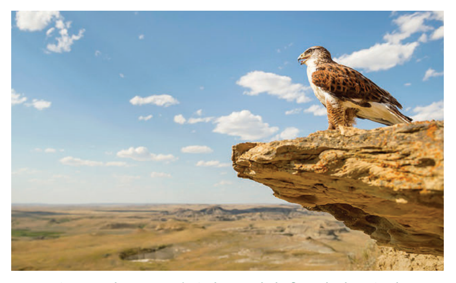
A Ferruginous Hawk ( Buteo regalis ) in the East Block of Grasslands National Park. Found in the three Prairie provinces and the 17 westernmost American states (excluding Alaska and Hawaii), this hawk is Apparently Secure (G4) but in Canada is listed as Threatened under the federal Species at Risk Act.