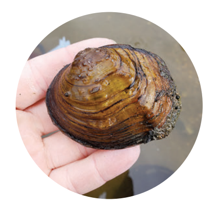
Like many freshwater mussel species, the Mapleleaf ( Quadrula quadrula ) faces multiple threats to its survival.

To further ascertain the distribution and habitat of the Mapleleaf in southcentral Manitoba, in 2018 the Manitoba Conservation Data Centre (MBCDC) collaborated with the Seine-Rat River Conservation District (SRRCD) to conduct mussel surveys within the district. The SRRCD is a non-profit organization provincially mandated as the planning authority for the Seine, Rat, and Roseau river watersheds. It focuses on riparian and ecosystem health, ground water quality and quantity, surface water quality and management, and environmental education.