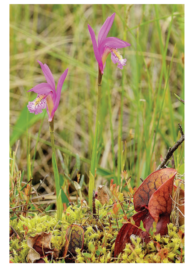
Dragon's Mouth Orchid ( Arethusa bulbosa) is a provincially rare (S1) plant growing in one of the newly-designated Important Plant Areas in Saskatchewan.

To date, eight sites have been designated for inclusion in the Vern Harms Important Plant Areas of Saskatchewan program. More information on the program, site criteria, and how to nominate a site can be found on the NPSS website at https://www.npss.sk.ca/news-and-events/projects/292. Nominations are adjudicated twice a year April and October (next intake is for October 2019).