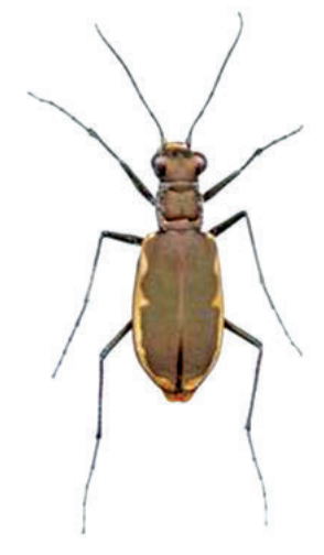
The Cobblestone Tiger Beetle (Cicindela marginipennis) is known in Canada only from the cobble shores of the Saint John River and the connected Grand Lake system in New Brunswick, and in 14 Americans states.

Seabeach Ragwort ( Senecio pseudoarnica ), found along sandy-gravelly ocean shores and upper beaches, is a globally Secure (G5) member in the Asteraceae family of plants. In Canada, though, it is Critically Imperiled (S1) in New Brunswick, Imperiled in British Columbia (S2) and in Nova Scotia (S2S3), Vulnerable on the island of Newfoundland (S3S4), and Apparently Secure in Québec (S4) and in Labrador (S4S5).