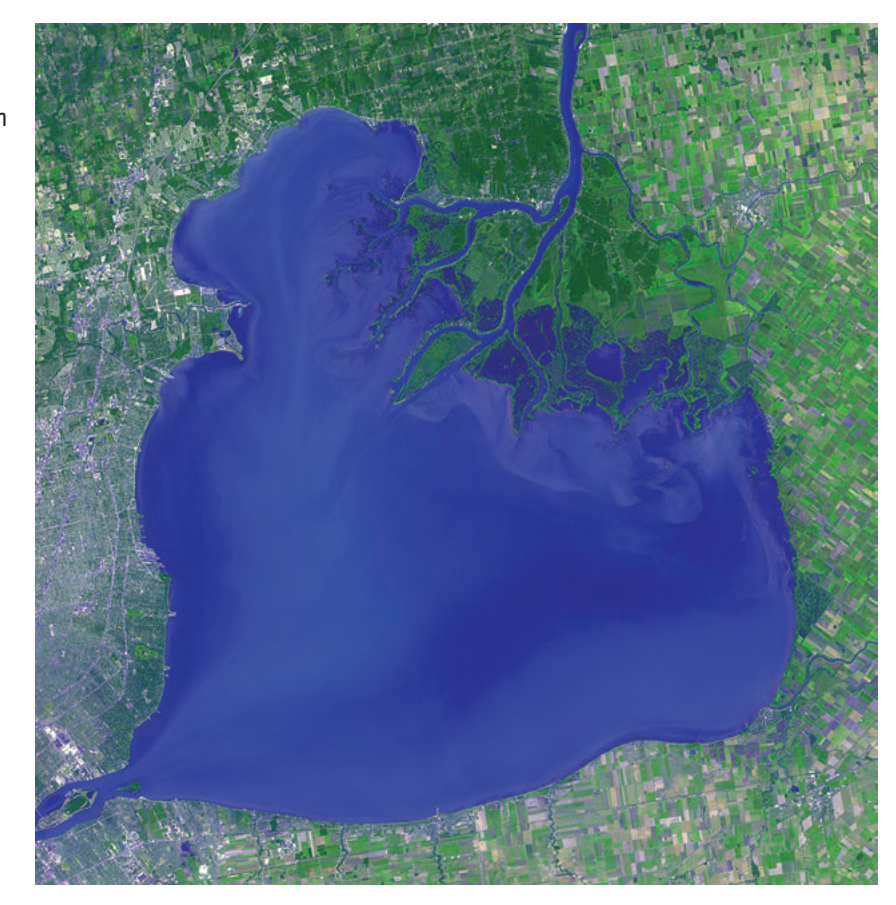
Much of Lake St. Clair and its watershed, shared between Ontario and Michigan, has been identified by NatureServe and partners as a Key Biodiversity Area (KBA) due to its significance for freshwater biodiversity. This KBA supports key Canadian populations of two mussel species listed as Endangered under the federal Species at Risk Act, the Eastern Pondmussel ( Ligumia nasuta ) and the Round Hickorynut ( Obovaria subrotunda ).

Sites qualify as KBAs when they harbour a significant proportion of the range-wide distribution of a given at-risk species or ecosystem. Example KBAs in Canada—identified with the support of NatureServe and NatureServe Canada—include 13 sites that provide habitat for 21 freshwater species which have geographically restricted ranges and/or are globally threatened. Such sites include lakes Cowichan and Mesachie on Vancouver Island, Banff Hot Springs in Banff National Park, eastern Lake St. Clair (pictured) in Ontario and Michigan, and the lower Saint John River in New Brunswick.