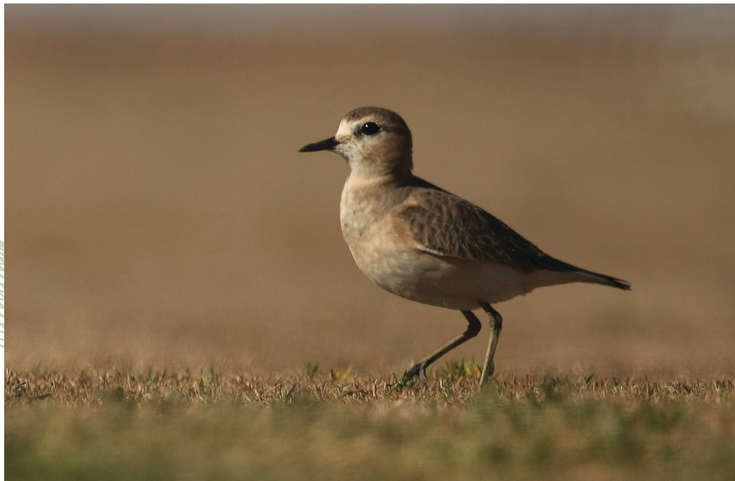
Mountain Plover ( Charadrius montanus ). N1B, N1M, S1B, S1M (Alberta, Saskatchewan).