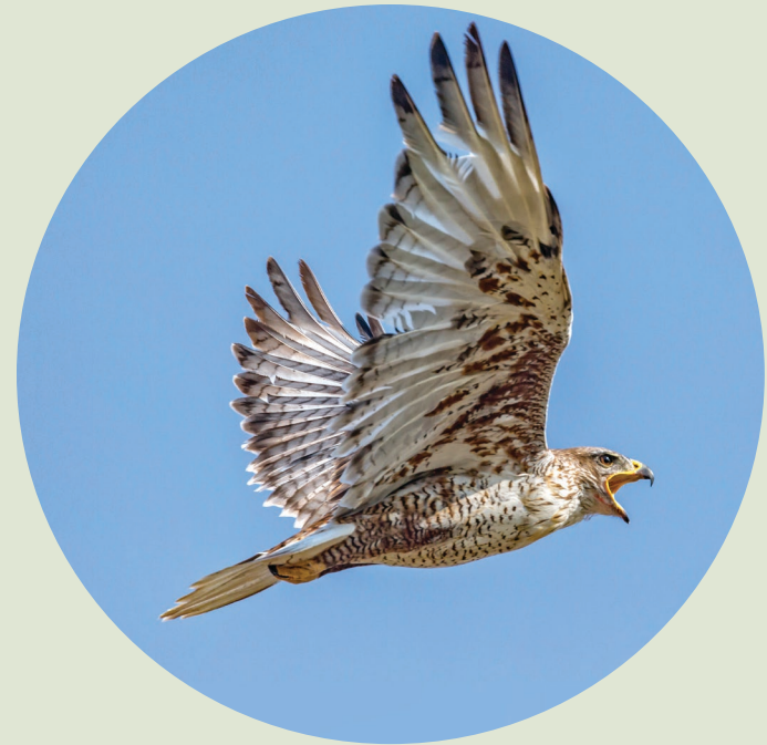
Ferruginous Hawk ( Buteo regalis ). N3B, N3N, NUM.