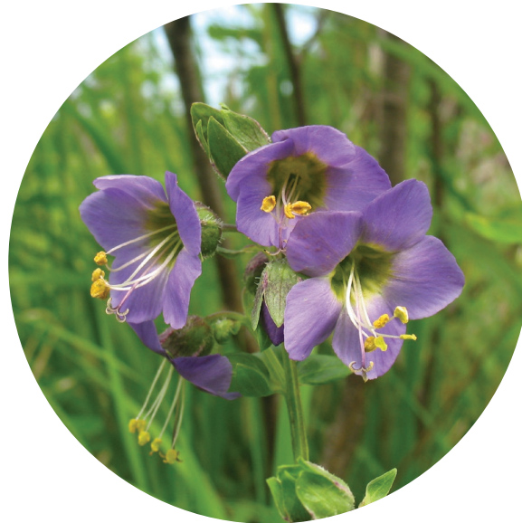
Van Brunt's Jacob's-Ladder ( Polemonium vanbruntiae ). N2, S1 (New Brunswick).

NatureServe Canada's mission is to be the authoritative, primary source of accessible, current and reliable information on the distribution and abundance of Canada's natural diversity, especially species and ecological communities of conservation concern.