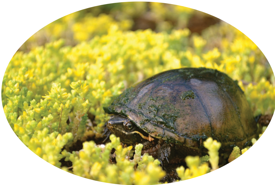
Eastern Musk Turtle ( Sternotherus odoratus ). N3. S3 (Ontario), S2S3 (Québec).