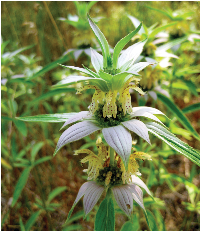
Spotted Beebalm ( Monarda punctata ). N1, S1 (Ontario, Québec).