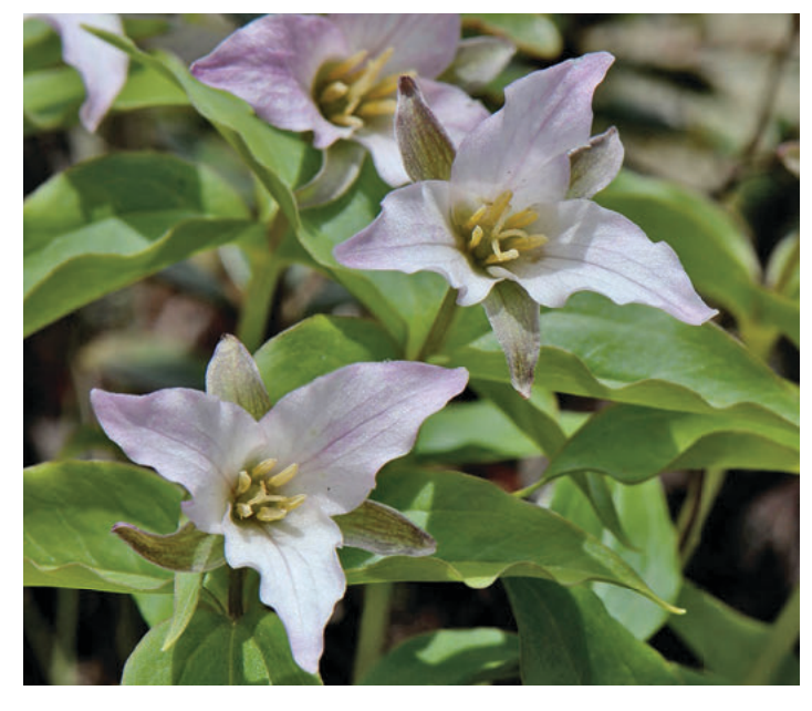
Dwarf Western Trillium ( Trillium ovatum var. hibbersonii ) occurs only in British Columbia.

of Canada have initiated a project to identify and catalogue Canada's endemic species. This list and report will be used to help prioritize species assessments, engage