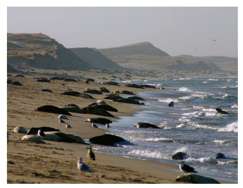
Grey seals ( Halichoerus grypus ) on Sable Island off the coast of Nova Scotia.