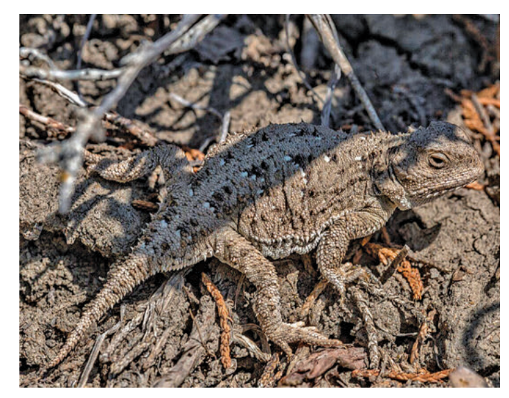
Short-horned Lizard ( Phrynosoma hernandesi ).

For biodiversity to endure it is imperative that sound knowledge about it be maintained and made widely available. At NatureServe Canada, our vision is a future where the natural heritage of Canada is documented, where that information is readily available, and where the conservation of biodiversity and resource decision-making in Canada are guided by high quality scientific data and information. Our mission is to be the authoritative, primary source of accessible, current, and reliable information on the distribution and abundance of Canada's natural diversity—especially species and ecosystems of conservation concern.