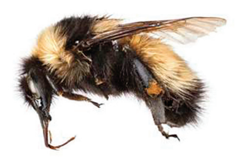
Kluane Bumblebee (Bombus kluanensis)

Through the Kluane BioBlitz, the YTCDC and partners aimed to record as many species as possible, to make unexpected discoveries adding to knowledge of Yukon's biota, and to raise public and scientific awareness of the biological richness of Kluane. More than 60 amateur and professional biologists and ecologists undertook intensive fieldwork across 13 specific sites, some only readily accessible by helicopter. BioBlitz results are still being