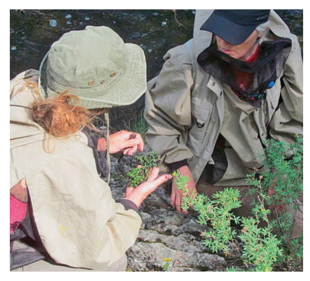
Surveying for mosses in the Northwest Territories.

Each NTCDC partner collects and shares data on species at risk. Using this information, from both traditional knowledge and western science, the NTCDC has employed the NatureServe methodology to create hundreds of Element Occurrence (EO) records. An EO is an area of land and/or water in which a species or natural community is, or was, present, and that represents viable habitat for that species or natural community. In 2018, the NTCDC completed its first data exchange with NatureServe, thereby providing access to NWT biodiversity information to an international audience via the online NatureServe Explorer portal and data requests managed by NatureServe and NatureServe Canada.