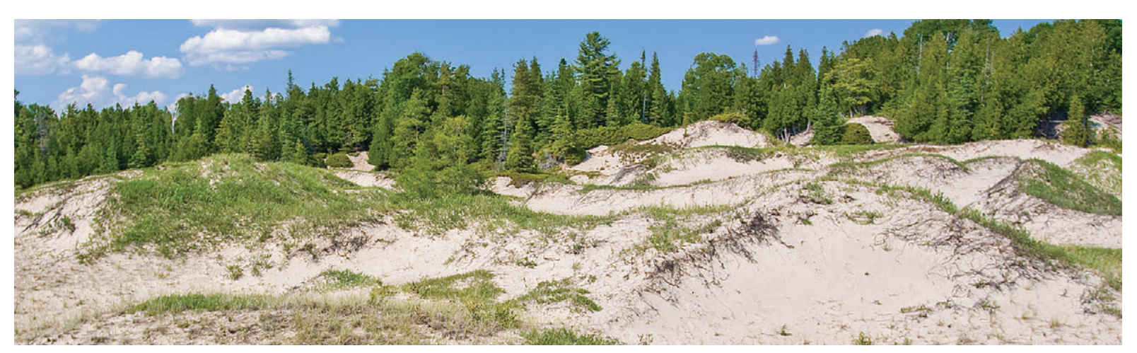
Sand dunes and associated plants at Carter Bay, Manitoulin Island.