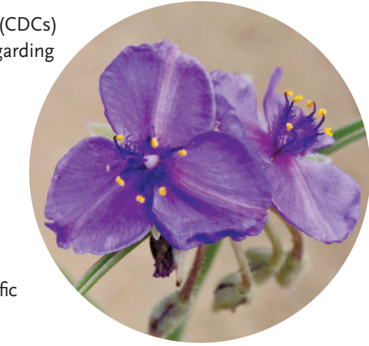
Western Spiderwort ( Tradescantia occidentalis).

A CDC is an organization with responsibility for biodiversity knowledge for the jurisdiction(s) it serves. Conservation Data Centres are located in British Columbia, Alberta, Saskatchewan, Manitoba, Ontario, Québec, Atlantic Canada, Yukon, Northwest Territories, and Nunavut. Each CDC adheres to NatureServe's rigorous scientific methods and standards developed since the 1970s—NatureServe's core natural heritage methodology.