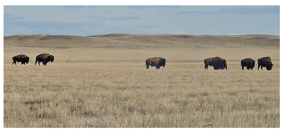
Bison (Bos bison) in Grasslands National Park.

HE PARKS CANADA AGENCY'S MANDATE is "to protect and present nationally significant examples of Canada's natural and cultural heritage, and foster public understanding, appreciation and enjoyment in ways that ensure the ecological and commemorative integrity of these places for present and future generations." In support of this mandate, Parks Canada aims to maintain viable populations of native species within Canada's national parks, national historic sites, and national marine conservation areas.