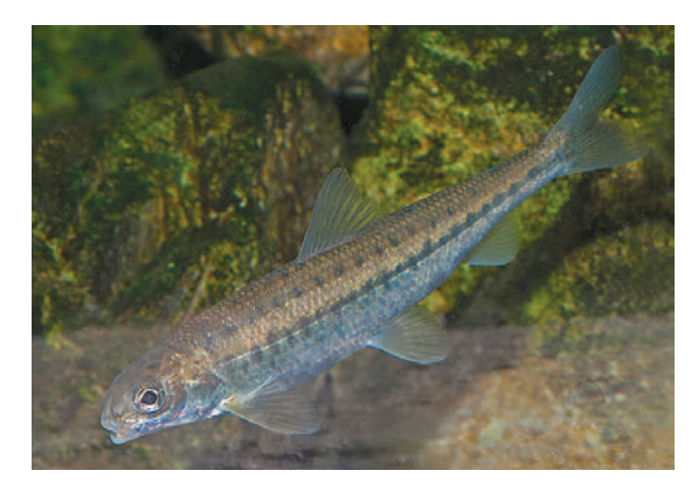
Pygmy Whitefish ( Prosopium coulterii ).

Tracking the status of species is essential for understanding changes in ecosystem health and for prioritizing species for conservation.