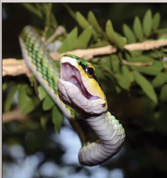
FIG. 2. This Leptophis mexicanus , assessed as Least Concern, was one of 24 reptiles recorded by participants when not in their working groups.