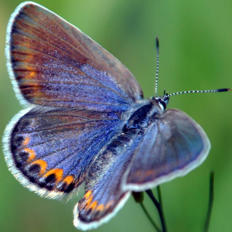
Karner Blue ( Plebejus samuelis), NatureServe Global Conservation Status: Critically Imperiled (G1); ESA Listing Status: Endangered.