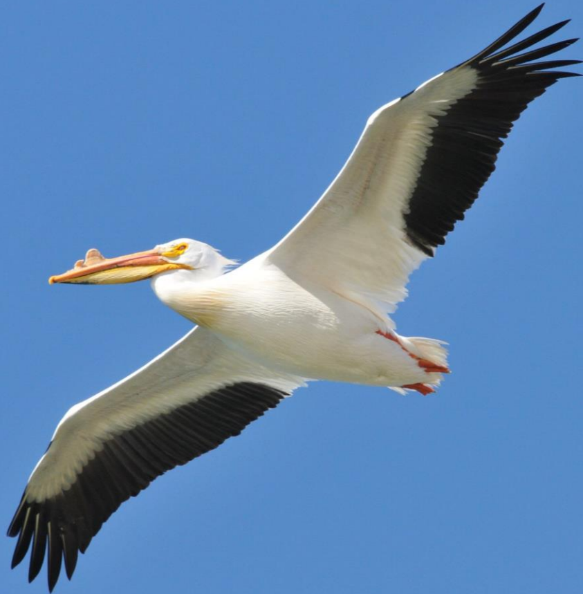
American White Pelican ( Pelecanus erythrorhynchos), NatureServe Global Conservation Status: Apparently Secure (G4).

Responsible companies like yours know how important it is to have an inspired workforce. Your commitment to biodiversity presents an opportunity for your network to feel connected to this cause. There are many creative ways to include your team on the journey. Let's brainstorm together.