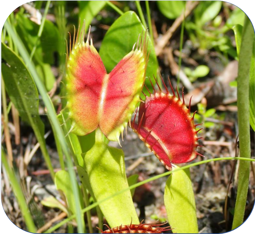
Venus' Flytrap ( Dionaea muscipula ), NatureServe Global Conservation Status: Imperiled (G2).