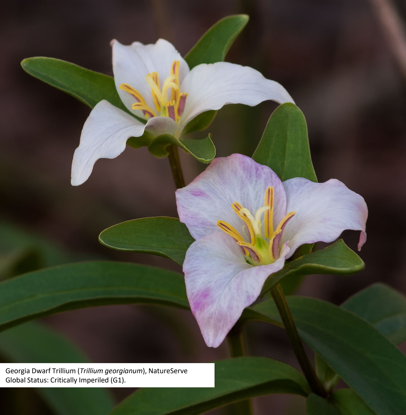
Georgia Dwarf Trillium ( Trillium georgianum ), NatureServe Global Status: Critically Imperiled (G1).