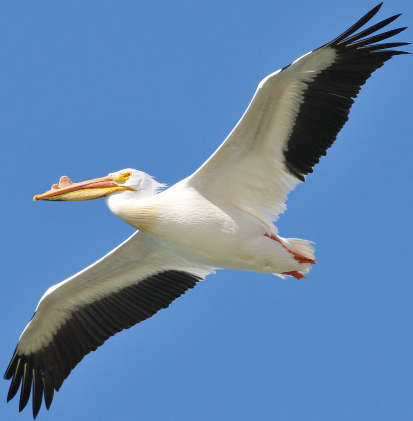
American White Pelican ( Pelecanus erythrorhynchos), NatureServe Global Conservation Status: Apparently Secure (G4).