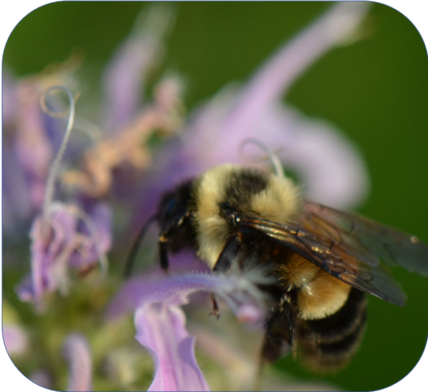
Rusty-patched Bumble Bee ( Bombus affinis ), NatureServe Global Conservation Status: Imperiled (G2); ESA Listing Status: Endangered.