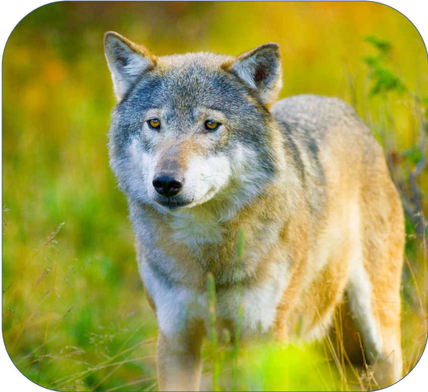
Gray Wolf ( Canis lupus ), NatureServe Global Conservation Status: Secure (G5).