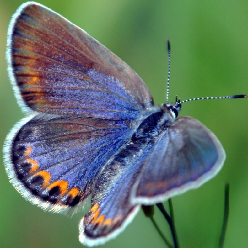
Karner Blue ( Plebejus samuelis), NatureServe Global Conservation Status: Critically Imperiled (G1); ESA Listing Status: Endangered.