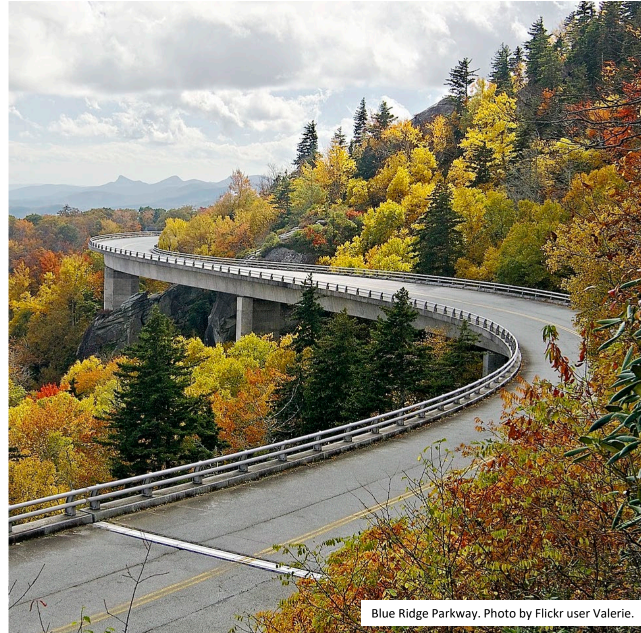
Blue Ridge Parkway.

With one million species at risk of extinction, there's no time to waste. We're hitting the road and invite you to join the adventure.