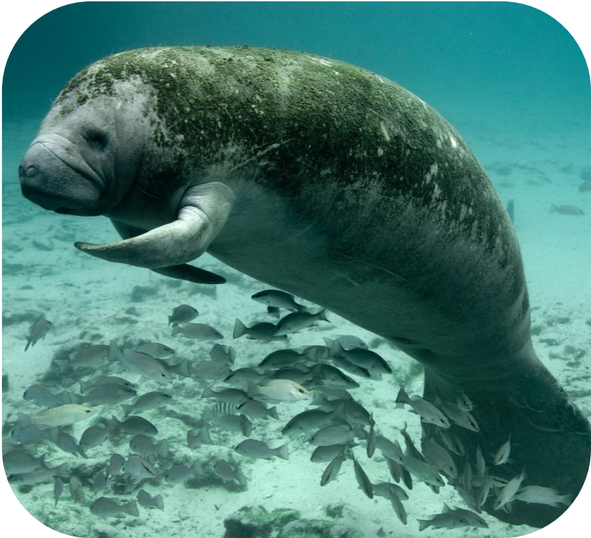
West Indian Manatee ( Trichechus manatus ), NatureServe Global Conservation Status: Imperiled (G2); ESA Listing Status: Threatened.