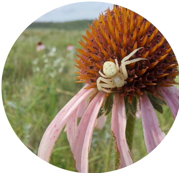
Echinacea angustifolia (Narrow-leaved Purple Coneflower), with Crab spider (species unknown) – G4, N3, S3 (Saskatchewan)

NatureServe Canada's mission is to be the authoritative, primary source of accessible, current and reliable information on the distribution and abundance of Canada's natural diversity, especially species and ecological communities of conservation concern.