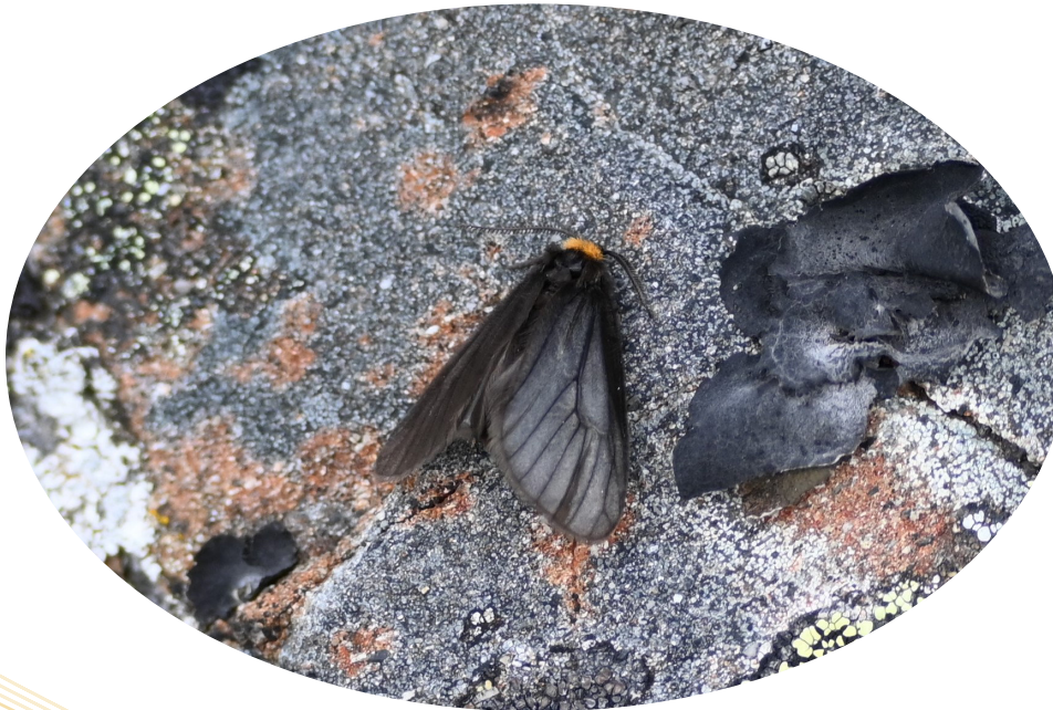
Acsala anomala (Rockslide Lichen Moth) British Mts., Ivavik National Park. Endemic to YT and AK. – G4G5, N4N5, S4S5 (Yukon)