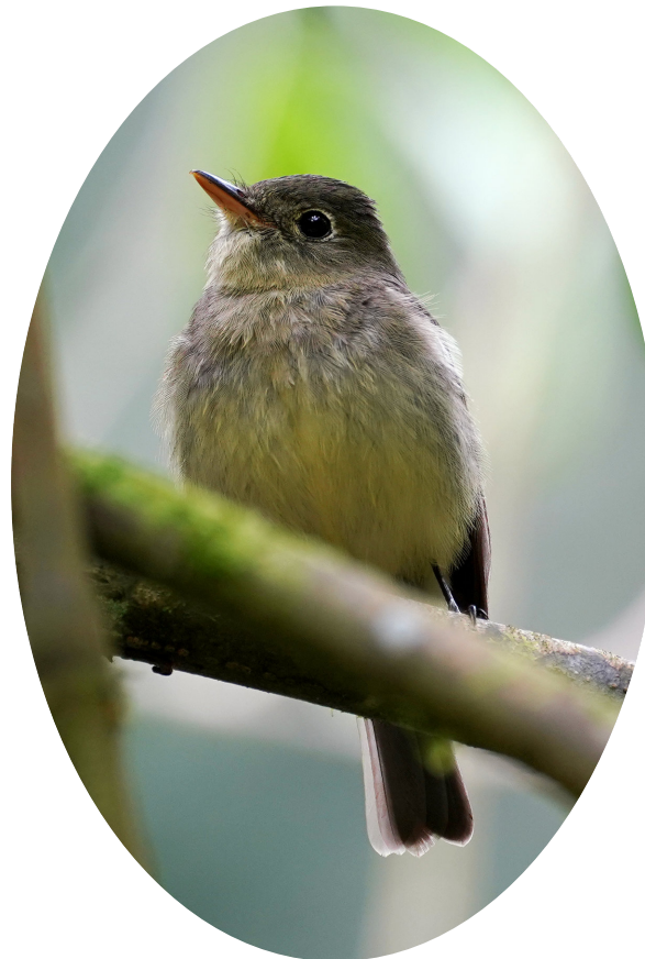
Empidonax virescens (Acadian flycatcher) – G5, N1B, S1B (Ontario)