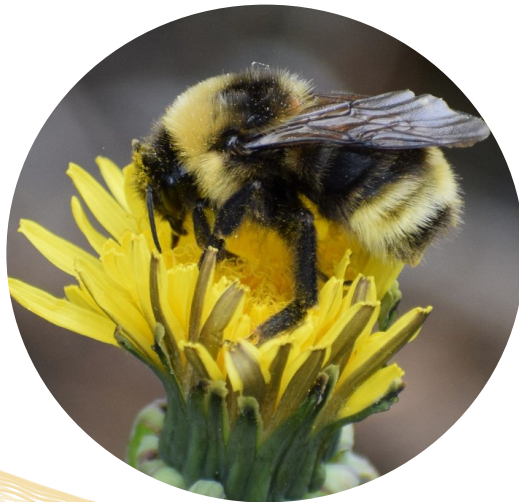
Bombus bohemicus (Gypsy Cuckoo Bumblebee) – G4, N2N3, S2 (Yukon)